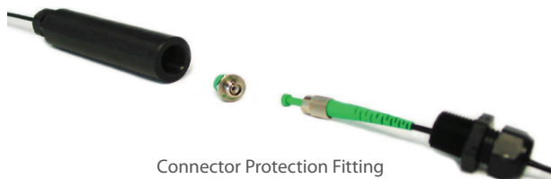
Connector Protection Fitting

With each sensor, Micron Optics provides a Sensor Information Sheet listing the gage factor and calibration coefficients needed to convert wavelength information into engineering units. Micron Optics' ENLIGHT Sensing Software provides a utility to calculate and then record, display, and transmit data for large networks of sensors. Installation, qualification and other sensor information is available at: http://www.micronoptics.com/support_downloads/Sensors/ .