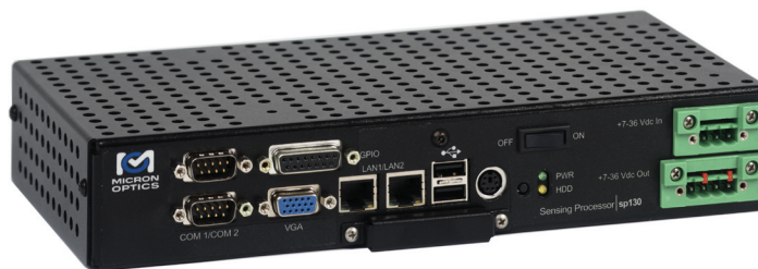
sp130 Sensing Processor Module

The data processing environment enabled by the sp130 helps engineers to bridge the gap between making measurements in the optical domain and reporting those results in the appropriate engineering units of strain, temperature, pressure, acceleration, etc.