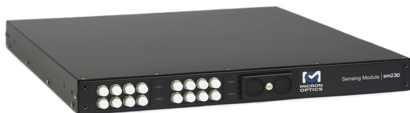
sm230 Rack Mount Module

The Micron Optics "sm - Sensing Module" platform responds directly to the user commands of the optical interrogator core and outputs sensor wavelength data via Ethernet port and custom protocol. All module settings, sensor calculations, data visualization, storage, and alarming tasks are run on external pc or sensor processor module. The Sensing Module platform is ideal for custom, client developed system management tools, but is equally compatible with local or remote installations of Micron Optics ENLIGHT.