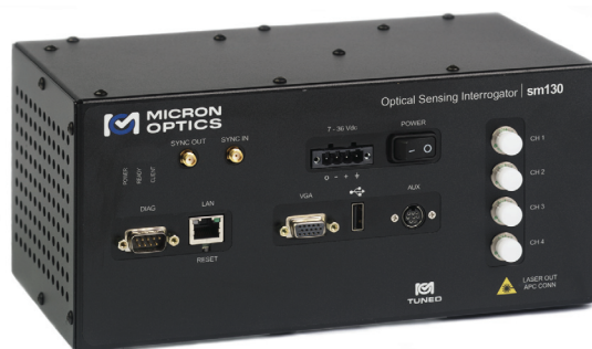
sm130 Field Module

The Micron Optics “sm - Sensing Module” platform responds directly to the user commands of the optical interrogator core and outputs sensor wavelength data via Ethernet port and custom protocol. All module settings, sensor calculations, data visualization, storage, and alarming tasks are run on external pc or sensor processor module. The Sensing Module platform is ideal for custom, client developed system management tools, but is equally compatible with local or remote installations of Micron Optics ENLIGHT.