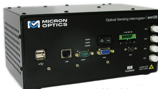
sm125 Field Module

The Micron Optics “sm - Sensing Module” platform responds directly to the user commands of the optical interrogator core and outputs sensor wavelength data via Ethernet port and custom protocol. All module settings, sensor calculations, data visualization, storage, and alarming tasks are run on external pc or sensor processor module. The Sensing Module platform is ideal for custom, client developed system management tools, but is equally compatible with local or remote installations of Micron Optics ENLIGHT.